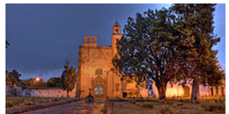
Popocatépetl's 16th century monasteries are World Heritage Sites

There are 35 UNESCO world heritage sites in Mexico as of 2018, more than anywhere else in the Americas. Most of them are in the cultural category and relate to either the pre-Columbian civilizations in the area or to early colonial cities established by the Spanish conquistadores and missionaries. Much of