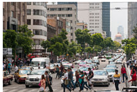
Downtown Mexico City

If driving in from the USA , always purchase Mexican liability insurance (legal defense coverage recommended) before crossing the border or immediately after crossing. When you are paying for your temporary import permit (for going beyond border areas), often in the same building there are several stalls selling Mexican auto insurance. Even if your American (or Canadian, etc.) insurance covers your vehicle in Mexico, it cannot (by Mexican law) cover liability (e.g., hitting something or injuring someone). You will probably spend time in a Mexican jail if you have an accident without it. And even if your own insurance does (in theory) provide liability coverage in Mexico—you'll be filing your claim from behind bars! Don't risk it, get Mexican auto insurance.