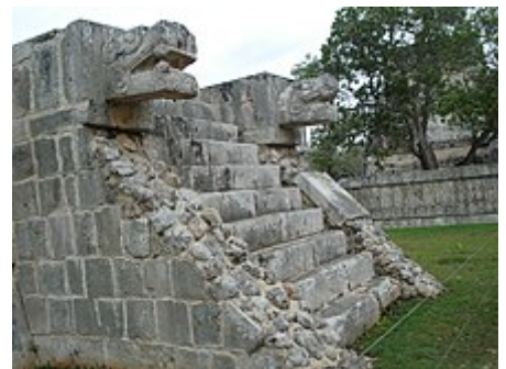
Chichen Itza, one of the most famous archaeological sites in the world