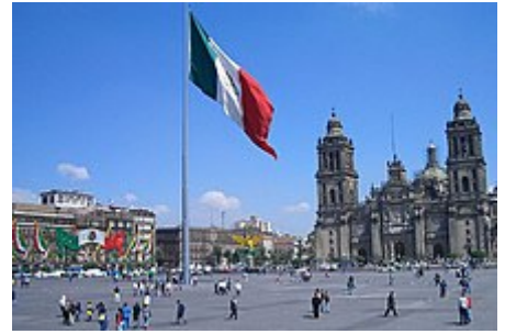
Plaza de la Constitución, also known as Zocalo, Mexico City