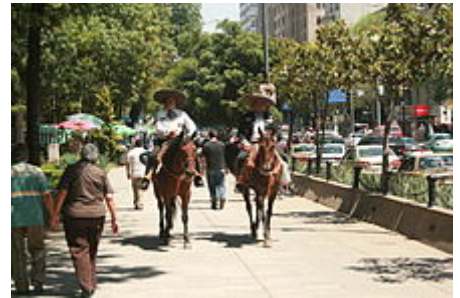
Mounted tourist police, Mexico City

Mexico has a reputation for being a dangerous country — a reputation that's not entirely unwarranted, but the average traveller should not be too overly concerned or cautious of their surroundings. A lot of the crime occurs between those involved in the drug trade (See drug traffic issues for more information), which doesn't affect tourists at all.