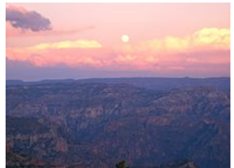
The moon is rising over Copper Canyon