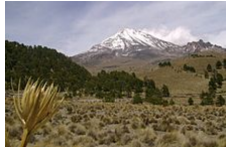
Pico de Orizaba or Citlaltépetl is Mexico's highest mountain

High, rugged mountains; low coastal plains; high plateaus; temperate plains with grasslands and Mezquite trees in the northeast, desert and even more rugged mountains in the northwest, tropical rainforests in the south and southeast Chiapas , Yucatán Peninsula semiarid in places like Aguascalientes , San Luis Potosí and temperate coniferous and deciduous forests in the central part of the country Mexico City , Toluca .