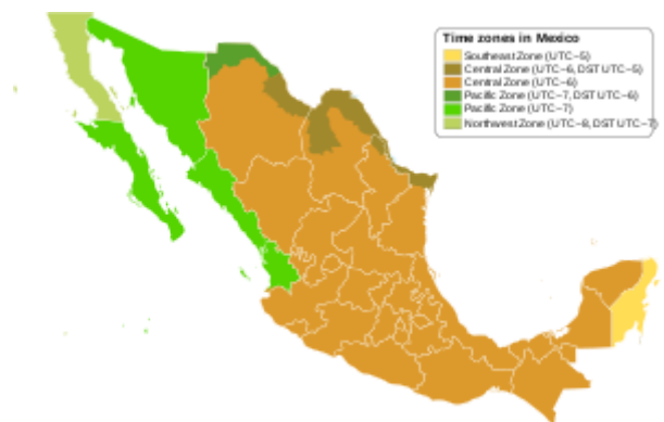
Mexican time zones

Almost all of Mexico observes daylight savings time (DST) from first Sunday in April to last Sunday in October. Communities on the U.S. border, except in Sonora, observe DST on the U.S. schedule. The entire state of Baja California also observes DST on the U.S. schedule. There will be several weeks each year