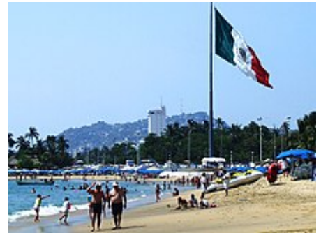
Hornos Beach in Acapulco

Many important headquarters are located throughout the main cities of Mexico. Top Mexican corporations such as Televisa, Bimbo, Cemex, Telmex and Vitra are often willing to hire professionals who are native English speakers as much of their business is developed alongside North American corporations.