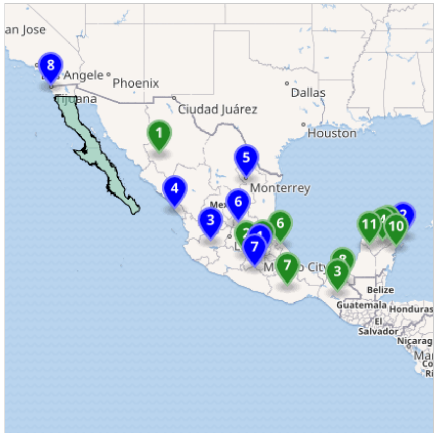
Map of Mexico