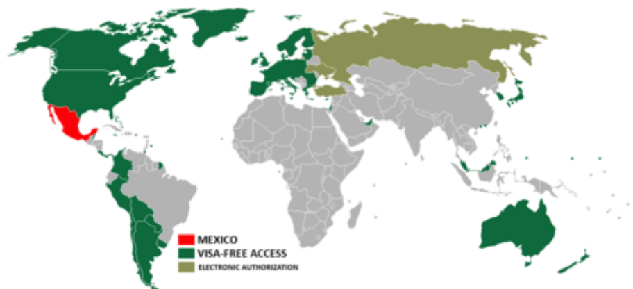
Visa policy of Mexico

via air, it is included in the price of the fare. This service is available to citizens of Andorra, Argentina, Aruba, Australia, Austria, Bahamas, Barbados, Belgium, Belize, Bulgaria, Canada, Chile, Colombia, Costa Rica, Cyprus, Czech Republic, Denmark, Estonia, Finland, France, Germany, Great Britain, Greece, Hong Kong, Hungary, Ireland, Iceland, Israel, Italy, Jamaica, Japan, Latvia, Liechtenstein, Lithuania, Luxembourg, Macau, Malaysia, Malta, Marshall Islands, Micronesia, Monaco, Netherlands, New Zealand, Norway, Palau, Panama, Paraguay, Peru, Poland, Portugal, Puerto Rico, Romania, San Marino, Singapore, Slovakia, Slovenia, Spain, South Korea, Sweden, Switzerland, Trinidad and Tobago, United States of America and Uruguay (see official list here ( http://www.inm.gob.mx/index.php/page/Paises_No_Visa/en.html )). Permanent residents of the United States, Canada, Japan, United Kingdom, and Schengen area countries are also eligible for visas on arrival regardless of citizenship.