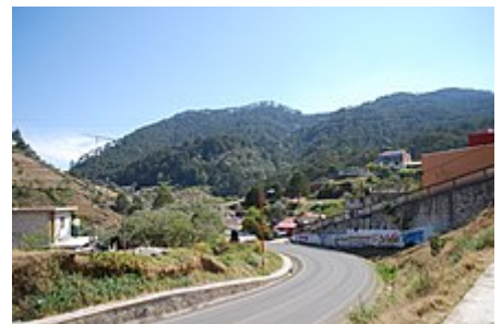
Highway 120 passing through the village of Pinal de Amoles

When traveling on Mexican roads, especially near the borders with the United States and Guatemala, one will probably encounter several checkpoints operated by the Mexican Army searching for illegal weapons and drugs. If you are coming from the United States, you may not be used to this, and it can be intimidating. However, these are rarely a problem for honest people. Simply do what the soldiers tell you to do, and treat them with respect.