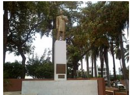
Statue of Benito Juárez in Hidalgo

Benito Juárez was the first president of indigenous descent in all of Latin America and is one very few figures that is still almost exclusively seen as a positive figure in Mexican history. He was president from 1858 to 1864 and again from 1867 to his death in 1872. His saying "el respeto al derecho ajeno es la paz" (respect for the rights of others is peace) is still frequently quoted.