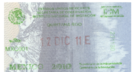
Mexican entry stamp