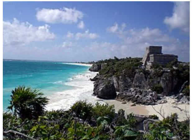
Mayan Ruins of Tulum