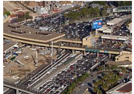
Crossing into Mexico from the U.S. near Tijuana