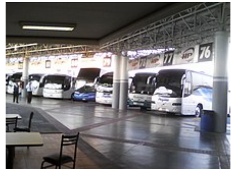
Buses at Morelia bus station