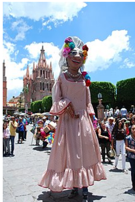
Festival in San Miguel de Allende

The great majority of the population is and traditionally has been Roman Catholic , and there is still a strong following of this faith among Mexicans from all socioeconomic backgrounds. However, there are sizeable Protestant, Evangelical, Pentecostal communities (in part due to US missionary activity) and the country also has one of the largest Jehovah's Witnesses communities. The irreligious are a small minority and they are found mostly among college-educated urban dwellers of the middle and upper middle class.