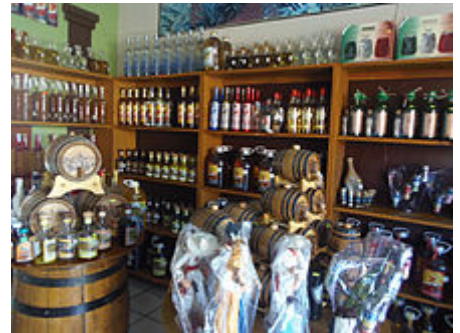
Tequila store in Tequila

Tap water is potable, but generally not recommended for drinking. Hotels usually give guests one (large) bottle of drinking water per room per night. Bottled water is also readily available in supermarkets and at tourist attractions.