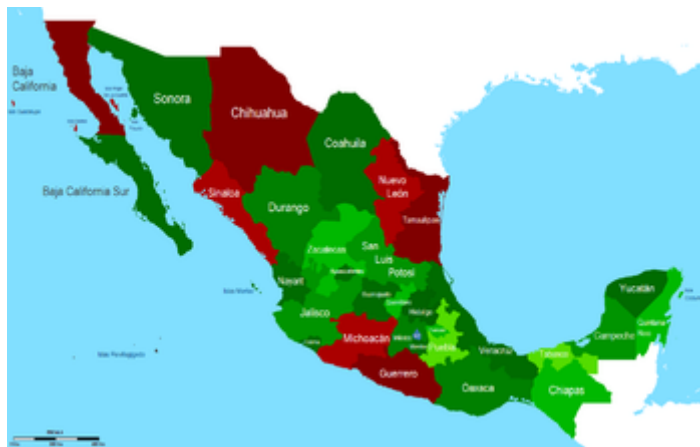
States with the most conflict, marked in red (2010)

Some Mexican northern and border cities such as Tijuana, Nogales, Nuevo Laredo, Chihuahua, Culiacán, Durango, and Juárez can be dangerous if you are not familiar with them, especially at night. Most crime in the northern cities is related to the drug trade and police corruption. However, since law enforcement figures are often overwhelmed battling drug-related activities, many northern border towns that were somewhat dangerous to begin with are now a hotbed for criminals to act with impunity. Ciudad Juárez, in particular, bears the brunt of this violence, and with nearly a fourth of Mexico's overall murders, travel there requires special attention.