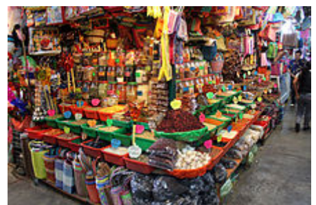
Spices for sale at a market in Oaxaca

Merchants are often reluctant to make change in smaller towns. Try to avoid paying with overly large denominations; the best customer has exact change. In rural areas, your 'change' may consist of chiclets or other small commodities.