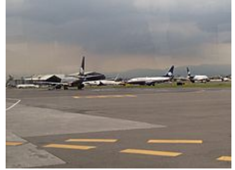
Aeromexico planes at Benito Juarez International Airport

San Antonio and Houston . In return, United Airlines/United Express (operated by Express Jet and Skywest) fly to additional cities in Mexico besides Guadalajara , Mexico City , Cancun , Puerto Vallarta and other major beach resorts (which are already served by multiple US and Mexican carriers) such as to Aguascaliente, Chihuahua, Ciudad de Carmen, Durango, Huatulco, Leon/Guanajuato, Oaxaca, Merida, San Luis Potosi, Tlaxcala, Toluca, Toluca, Toluca, Toluca, Tampico, Veracruz and Villahermosa from Houston . Flights to additional Mexican cities are operated by Aeromar on a code-share basis.