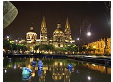
Plaza de liberación and the Cathedral, Guadalajara

There is a large backpacker culture in Mexico, and there are many hostels offering dorm accommodation and private rooms. You can expect to pay M$100-300 (Nov 2021) for a night in a dorm, sometimes including breakfast. Hostels are a fantastic place to share information with fellow travelers, and you can often find people who have been to your future destinations.